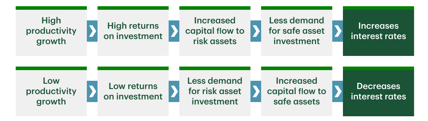
Figure 3: Productivity Growth and Interest Rates

Generally, attractive investments attract capital because those investment opportunities yield appealing returns. If attractive investments are less abundant, some of the capital will be redirected to safe assets/bonds. So, lower productivity growth doesn't attract as much capital investments and investors allocate more to safe haven assets. As demand for safe assets increases, this will drive down required return in those assets, which in turn will suppress the natural interest rate.