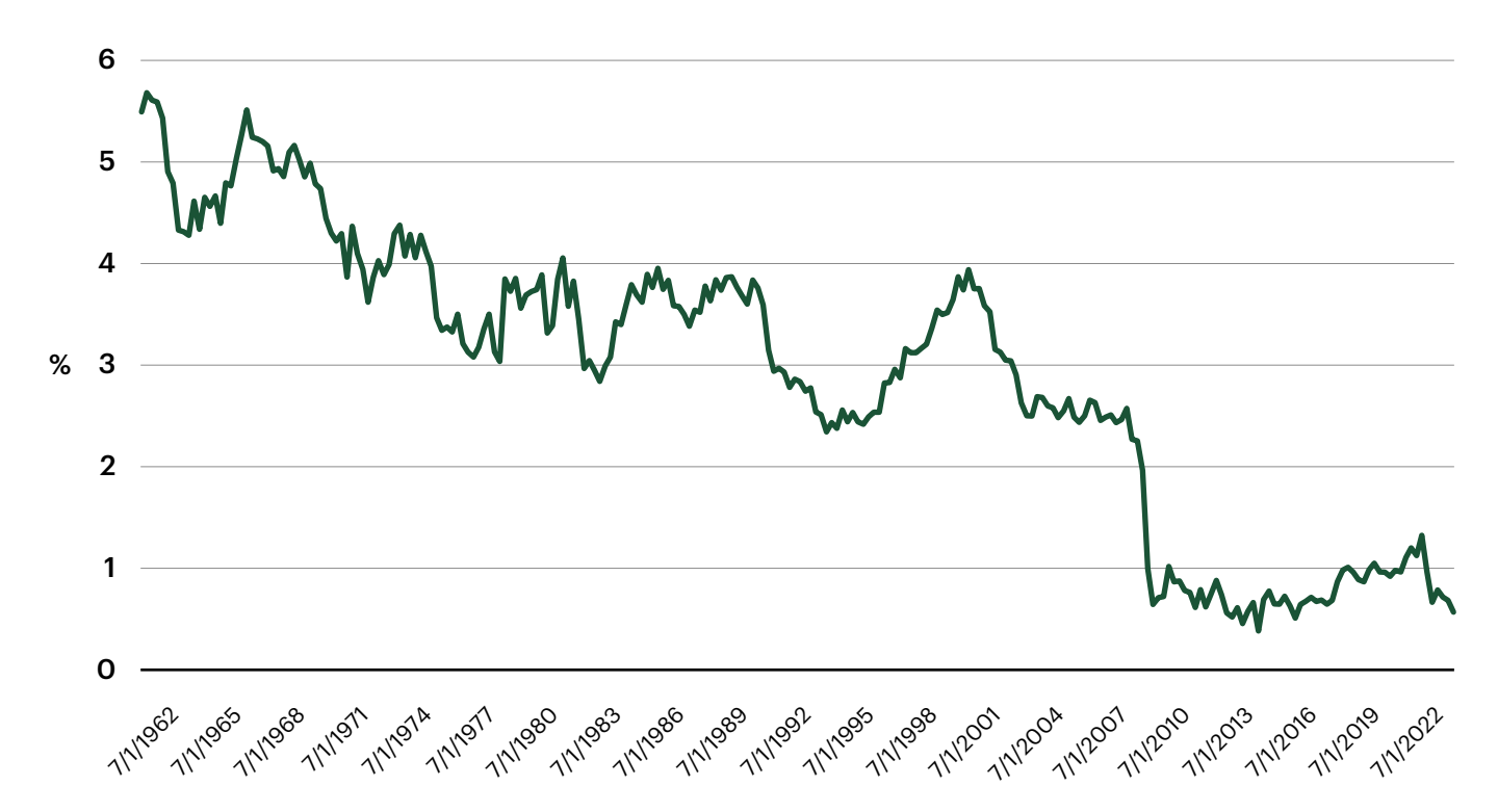
Figure 1: R-star for the US