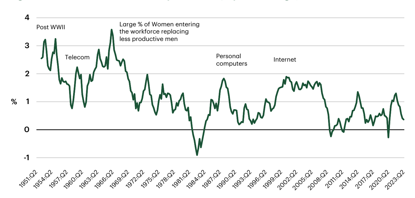
Figure 2: Total Factor Productivity in the US (5-year average)