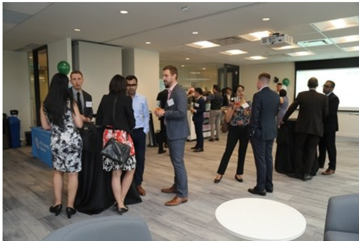
Alpha/Beta Room Event