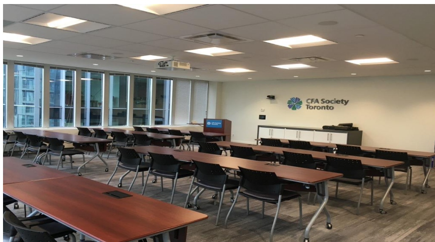
Alpha Room (classroom style set-up)