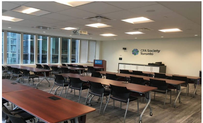
Alpha Room (classroom style)