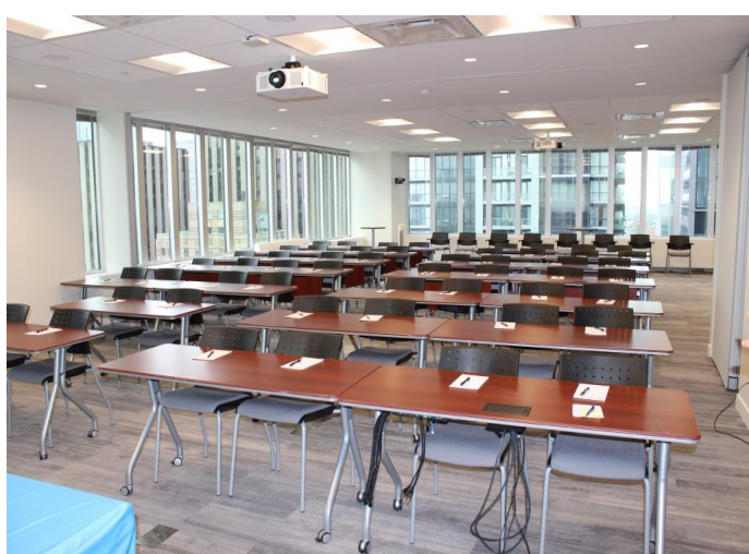
Alpha & Beta Room Combined