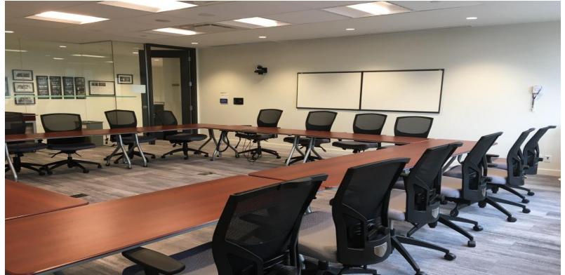
FactSet Room (Hollow Square style)