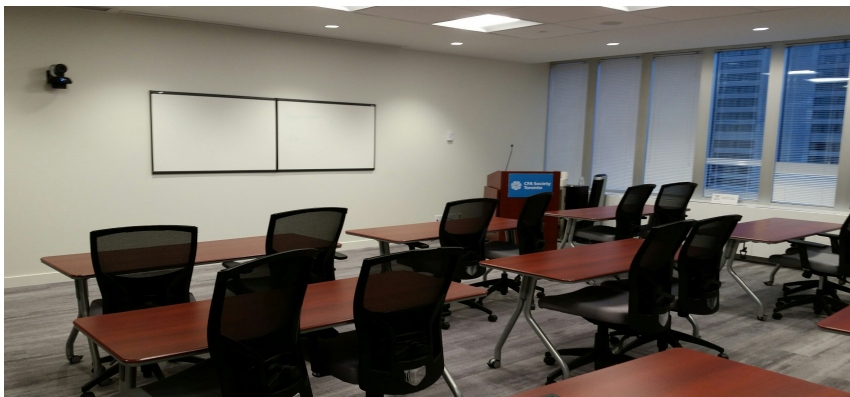
Beta Room (classroom style)

**A/V is defined as: projector, screen, one extension cord and wireless internet connection. Laptop not provided.